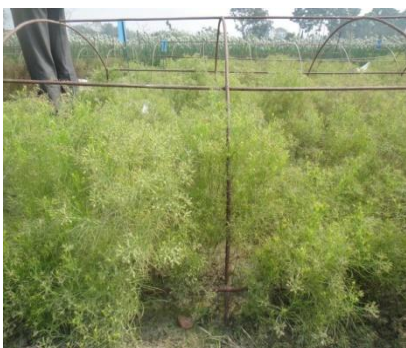
Plate 2. Rovral sprayed plot

In a column, similar letter(s) do not differ significantly at 5% (*) level of provability. Data represent in parentheses of Angular or Arcsign transformation.