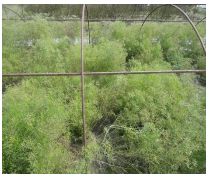
Plate 3. Companion sprayed plot