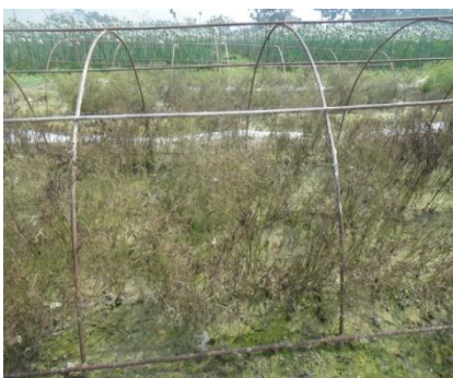
Plate 4. Control plot