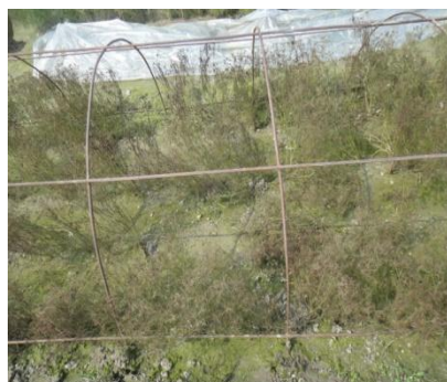
Plate 5. Sunvit sprayed plot