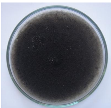
Plate 1: Isolate of Alternaria burnsii of Cumin

Seeds were sown on November 18, 2014. Five weedings were done at 15, 30, 45, 60 and 75 days after emergence and five irrigations were also applied just after five days of each weeding. Other intercultural operations were done to maintain the normal hygienic condition of crop in the field. Bavistin DF (0.2%) was sprayed at plant base at soil level five times at an interval of 10 days from seedling stage to control wilt of cumin. The plots were inspected regularly to take observations on blight disease from seedling to maturity stage of the crop. Disease plant parts were collected in laboratory for identifying blight causal pathogens (Plate 1). The crop was harvested from March 26-31, 2015. Data were recorded on blight, number of primary branches/plant, plant height at harvest, number of umbels/plant, number of umbel lets/plant, number of seeds/umbel, number of seeds/plant, weight of seeds/plant and seed yield (kg/ha). Percentage data were converted into angular or arcsign transformation. The recorded all data were analyzed statistically to find out the level of significance and the variations among the respective data were compared following Duncan's New Multiple Range Test (Gomez and Gomez, 1984).